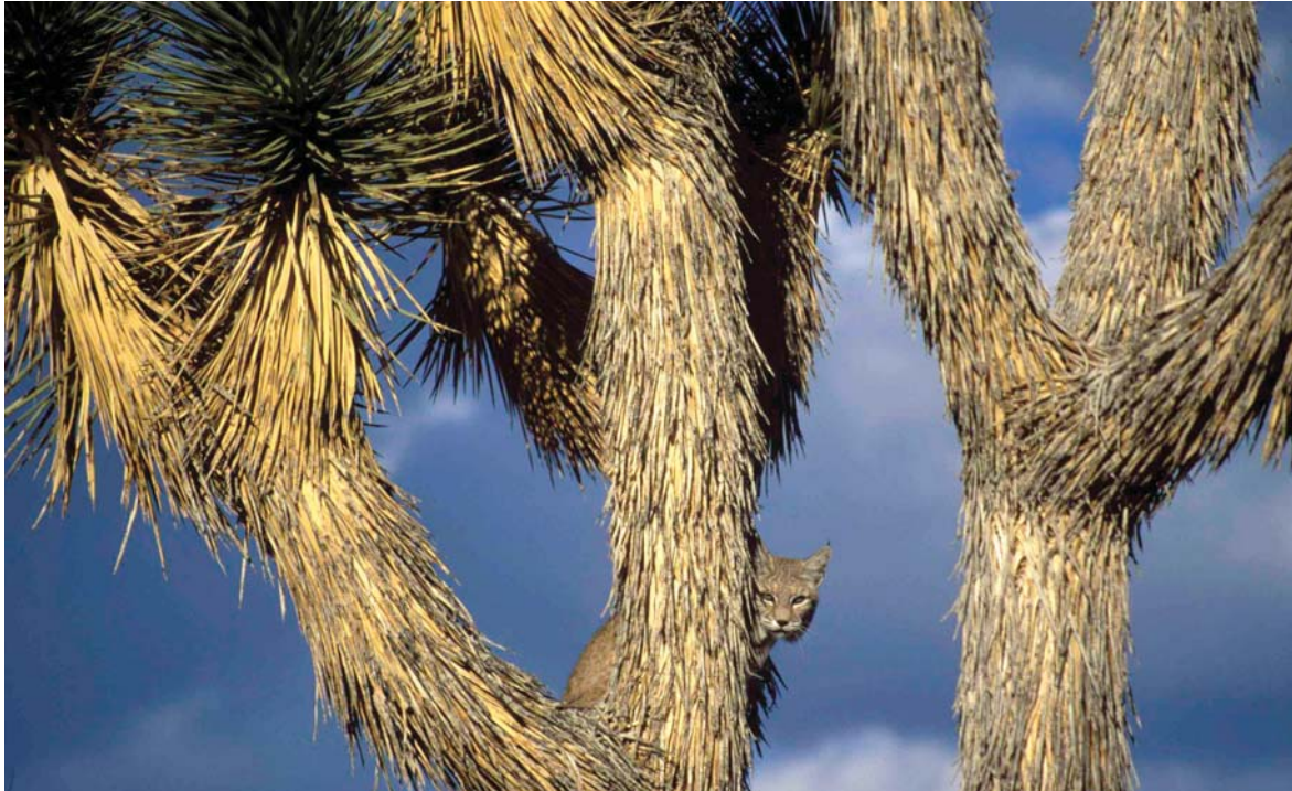
The preservation of the Antelope Valley Region's unique environmental features can be achieved through integrated surface and groundwater management actions.

and it is not anticipated that the existing arsenic problem will lead to future loss of groundwater as a water supply resource for the Antelope Valley.