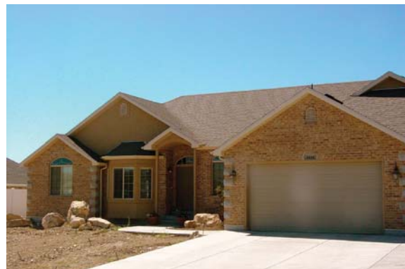
The expected rapid growth in the Antelope Valley Region will affect water demand and increase the threat of water contamination from additional wastewater and urban runoff without proper management.

What people do on the land of the Antelope Valley and how they do it directly impacts many aspects of life, including the water cycle, within the Antelope Valley Region. Historically throughout California, land use planning and water use planning have been done almost independently of one another. The challenges identified within the Plan clearly show a need for much closer collaboration between