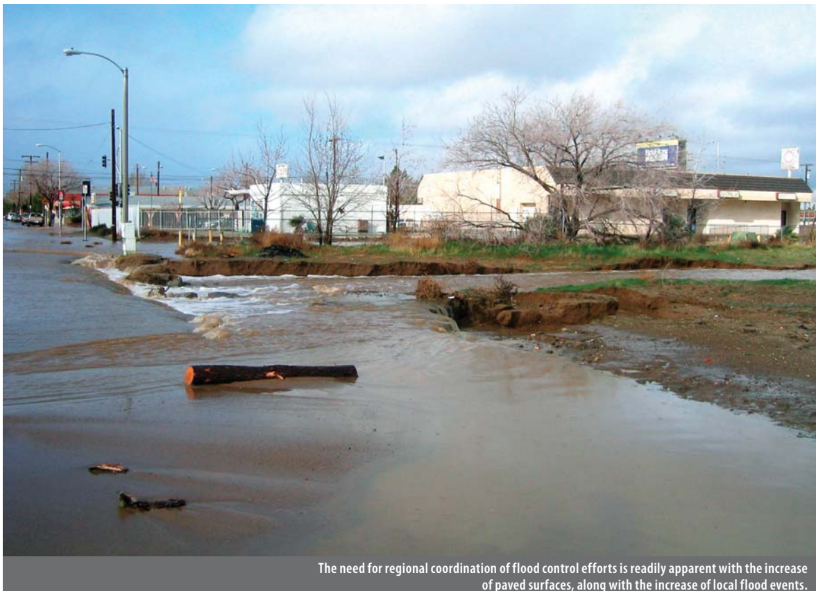
The need for regional coordination of flood control efforts is readily apparent with the increase of paved surfaces, along with the increase of local flood events.

The groundwater basin within the Antelope Valley Region is an undrained, closed basin, meaning there is no outlet for water to flow to the ocean. When water enters a closed basin, any minerals or chemicals in the water typically accumulate in the basin. Currently, groundwater quality is excellent within the principal aquifer but is not as good toward the northern portion of the dry lake areas. Some portions of the basin contain groundwater with high fluoride, boron, total dissolved solids, and nitrate concentrations. Arsenic is another emerging contaminant of concern in the Antelope Valley Region and has been observed in LACWWD 40, PWD, Boron, and QHWD wells. Research conducted by the LACWWD and the United States Geological Survey has shown the problem to reside primarily in the deep aquifer,