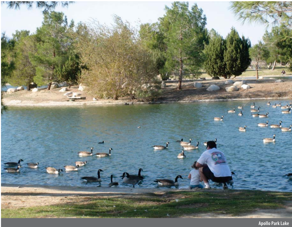
Apollo Park Lake

should contribute in some way to achieving these objectives. Also, because the planning targets are measurable, residents within the Antelope Valley Region can monitor how well the Plan is being implemented.