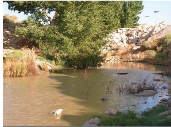
Stephen Sorenson County Park, a community recreation facility within the Antelope Valley, is home to “Lovejoy Springs” as it is known by the community.

These objectives and planning targets represent the most important things the Stakeholders have chosen to work together to accomplish over the next several years. Everything done within the context of this IRWM Plan